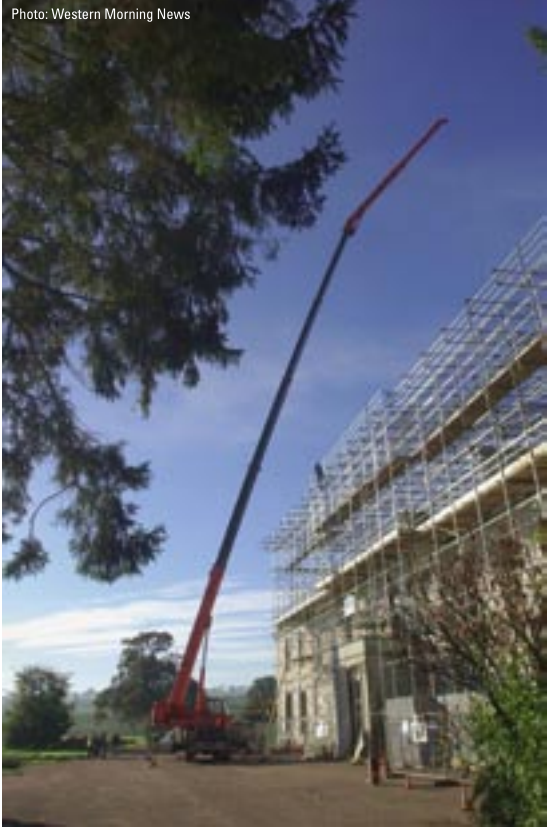
The crane from Apex Scaffolding Ltd lifting the temporary roof protection into place.